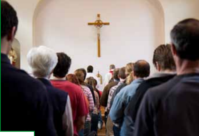
Gathered for Prayer in the St. Therese Chapel

triumph is structured around facilitated sessions and daily opportunities for experiencing God's love through the Sacraments, Adoration, and both community and personal prayer time; Every aspect is rooted in Biblical and Tradition principles.